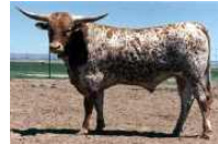
Kickapoo Farms 185